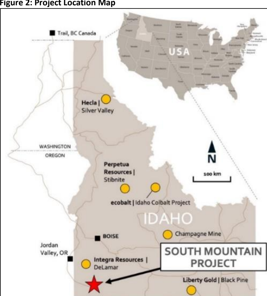
Figure 2: Project Location Map

BeMetals formed a Boise, Idaho-based project team that is focused on advancing South Mountain. This team includes key management of Thunder Mountain Gold Inc., Optionee of the Property. The project team has completed two phases of drilling and is now working on a Preliminary Economic Assessment. The team continues to build and maintain strong relations with local communities relevant to the South Mountain Project. The Project is largely on and surrounded by private surface land, and as such, the permitting and environmental aspects of the Project are expected to be straightforward. Permits are in place for underground exploration activities and BeMetals does not anticipate significant barriers to any future development at the Project.