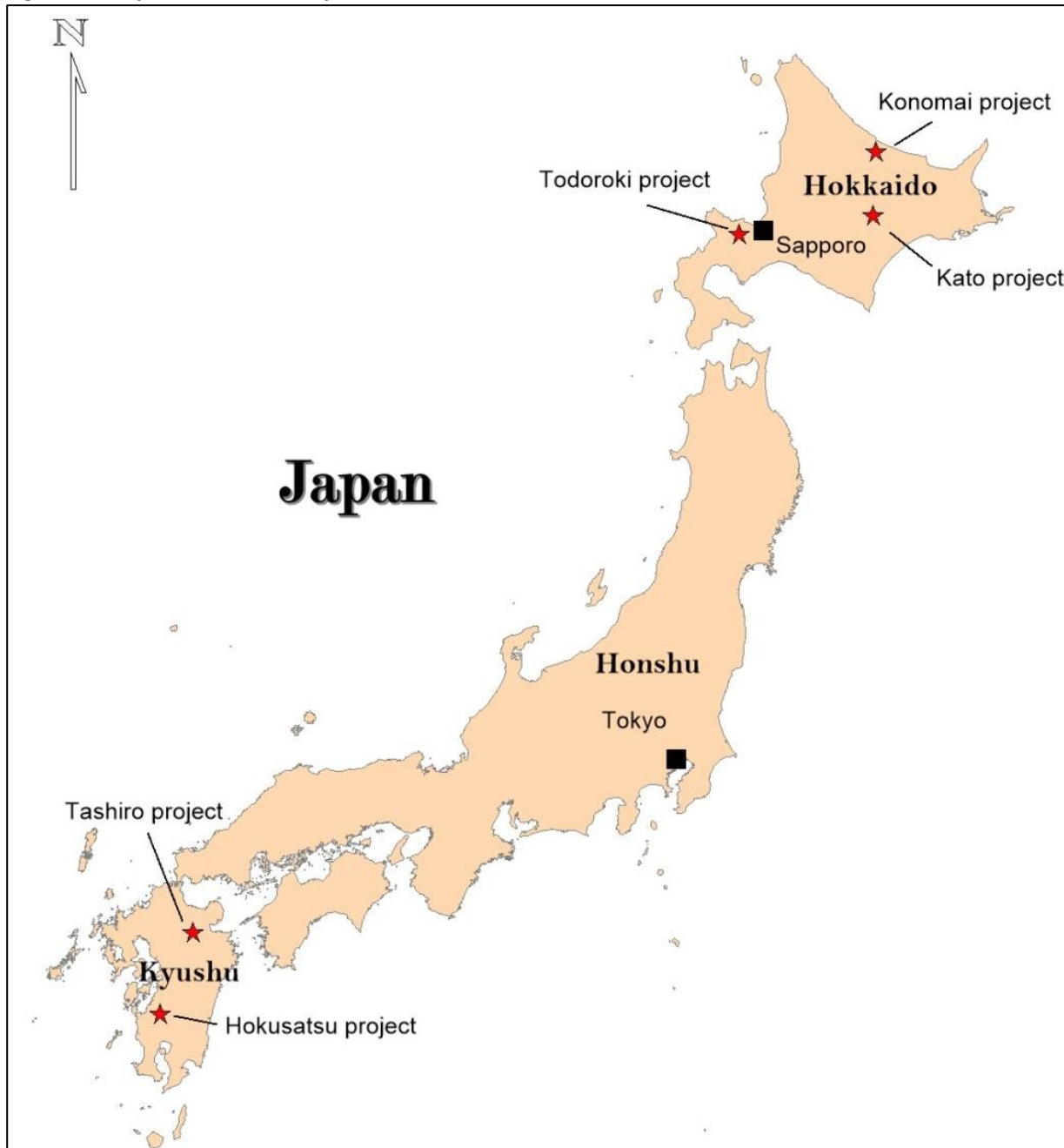
Figure 1: Project Locations Map

These drill results are historical in nature. BeMetals has not undertaken any independent investigation of the sampling nor has it independently analyzed the results of the historical exploration work in order to verify the results. BeMetals considers these historical drill results relevant as the Company will use this data as a guide to plan future exploration programs. The Company also considers the data to be reliable for these purposes however the Company's future exploration work will include verification of the data through drilling. *Drill hole ended in mineralization. It is estimated based upon the historical data that true widths might range from 80-90% of the drilled intersections. A nominal cut-off grade of 0.5 g/t Au has been applied to determine the boundaries of the intersections.